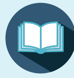
PERIODICALS AND JOURNALS