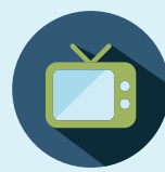
RADIO AND TV BROADCASTING